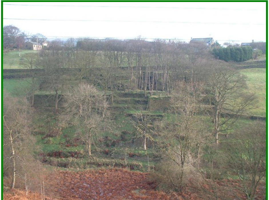
Photo looking across the valley to the 'Ogden Hydro' Clearly shows a lot of effort has been put in. But why?